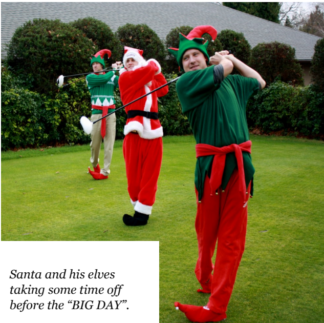
Santa and his elves taking some time off before the "BIG DAY".